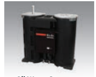
Oil Water Separator