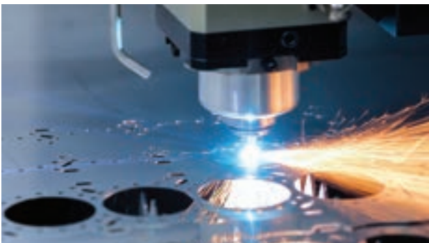
Metal Working and Laser Cutting