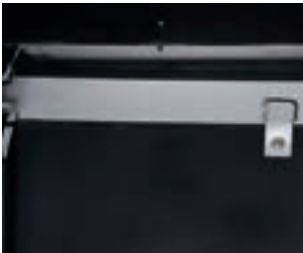
Optimised Cooling System for 122°F High Ambient Temperature