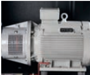
Reliable and Efficient TEFC Motors for Severe Duty Industrial Applications