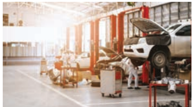
Vehicle Service Station