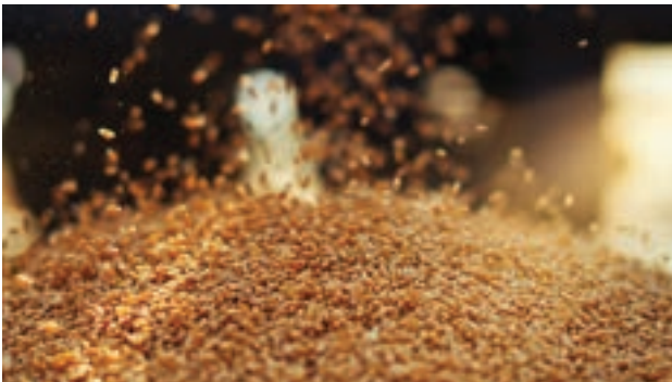
Sorting and Peeling