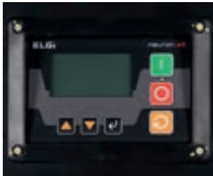
Easy to use Neuron XT Controller