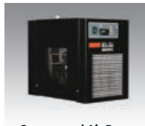
Compressed Air Dryer