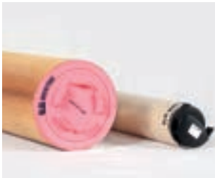
Heavy Duty Filtration for Demanding Conditions