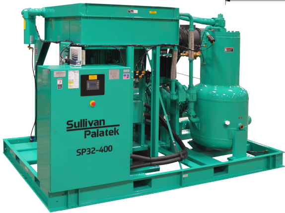
« Air Compressor shown with standard open configuration.