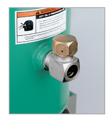
Lube Fill & Level Elbow

ASME coded 200PSIG tank, safety relief valve, minimum pressure/check valve, high efficiency replaceable air/lube separator element and oil return flow sight glass.